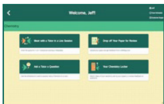
Improved usability and a more modern look.