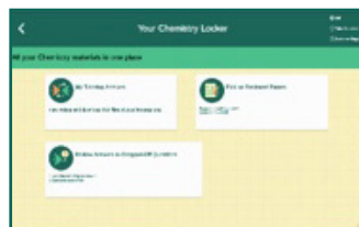
Access all your materials in one place!